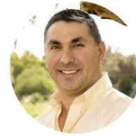
GARY SNYDER (invited, not attending)