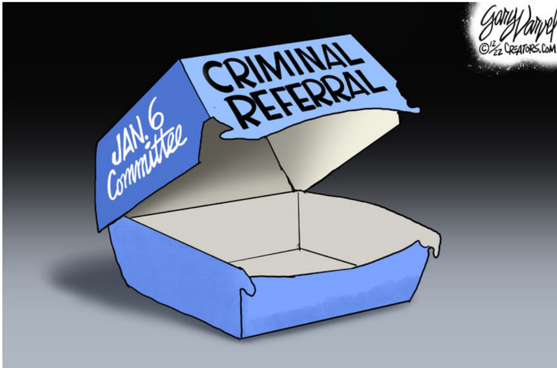
The NOTHING BURGER