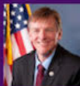
Congressman Paul Gosar, D.D.S. (AZ-04)