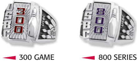
◀ 300 GAME