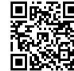
Scan For Playbill