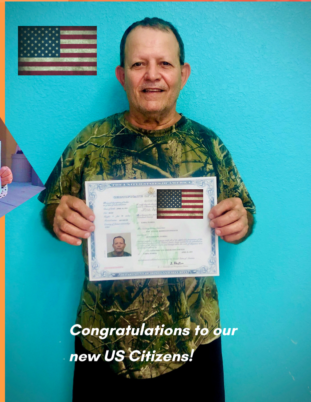
Congratulations to our new US Citizens!