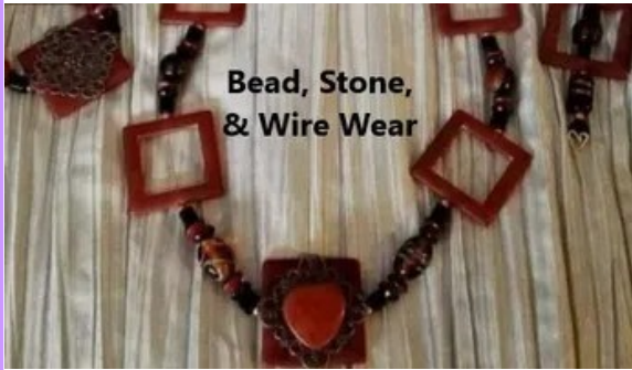
Bead, Stone, & Wire Wear

Daytona Dog Beach, Inc.'s Newsletter Sponsor