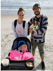
Top Collectors are Trashiest Peeps on the Beach!