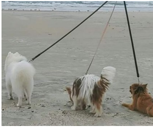
Sign the Petition for Change on our website or Facebook Page.