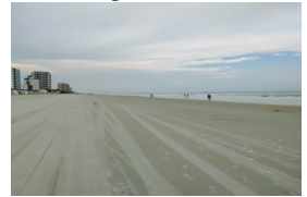
There is room for all!!

which would allow access for people with physical limitations and handicaps.