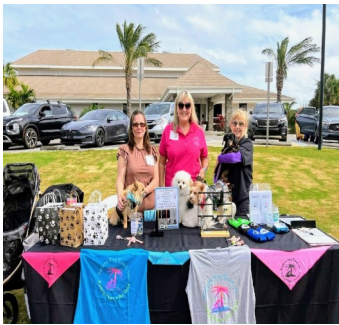
A paw-fect day to spend with our neighbors and their beloved pups. We provided doggie bags for all fur-babies, small, medium and large!!

In November, we were pleased to be invited for a 2nd year to "Canines at the Club", an annual event hosted by Oceanside Country Club. It offers a chance for members and their dogs to gather to socialize, compete and just have fun together. We were so pleased to see some pups adopted from Halifax Humane Society at the 2001 event show up with their forever families to enjoy the festivities. And some new pups from Halifax Humane Society were adopted this year. Hope to see them in 2023. We observed so many great moments. Here are but a few we captured.