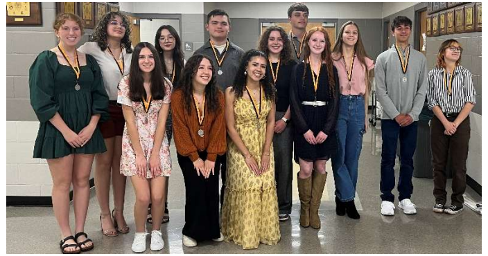
Sophomore Class Scholars