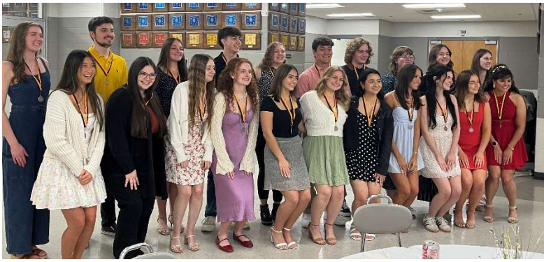
Senior Class Scholars