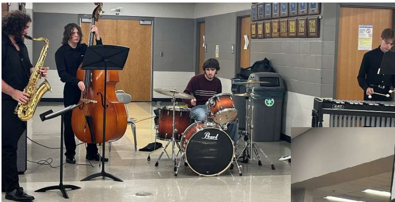
RPHS Jazz Ensemble