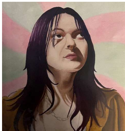
"Me and Myself"

A reflection of who I once was that will live on longer than I will