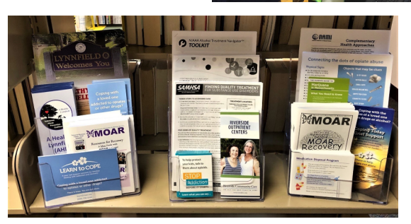
Above and Right: New Library Resources on Recovery and Community Resources on Underage Drinking