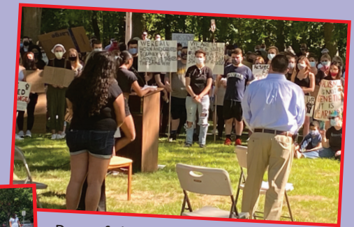
Peaceful Black Lives Matter demonstration