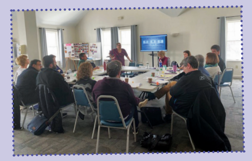
The Mental Health First Aid Training with Lynnfield Clergy