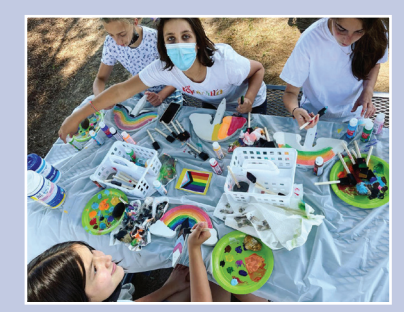
Rainbow Pride Month Project with Lynnfield Marketstreet