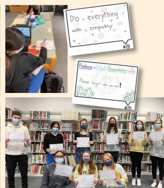
Youth Council created "Be It" images that reflect their own personal brands.