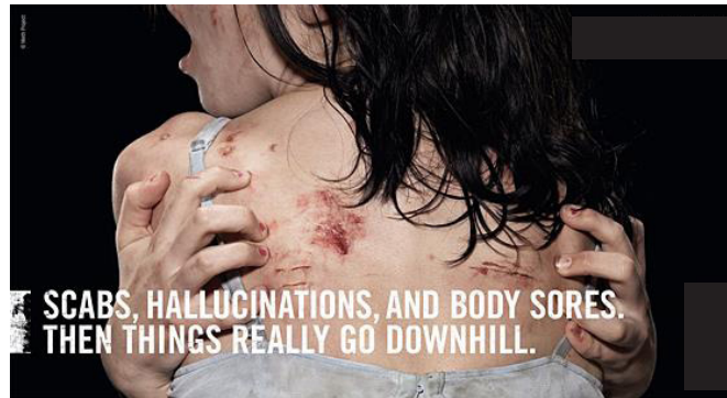
Using scary images is NOT effective.

You may think these techniques worked on you when you were younger, but really you may have been born with a natural “resilience” to avoiding drugs or other protective factors in your life. Kids who are truly at-risk won’t connect their current behavior to those “future” images. In fact, researchers say some may actually rebel against your message and start using drugs in order to prove you wrong. 19