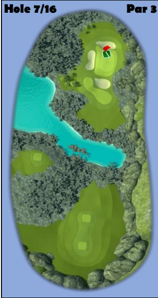
Hole 7/16 Par 3