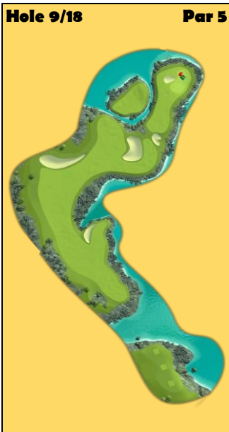
Hole 9/18 Par 5