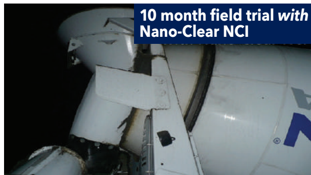
10 month field trial with Nano-Clear NCI

Even sticky concrete dust releases easily from Nano-Clear NCI