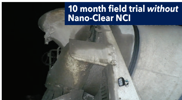
10 month field trial without Nano-Clear NCI

High crosslink density provides highly functional surface properties, including unmatched corrosion resistance, scratch resistance, chemical resistance and UV durability. It also means low surface energy, repelling water (hydrophobic) and aiding in the release of ice, dirt, brake dust, and even concrete dust.