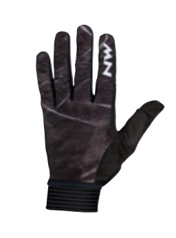
07 BACK / GREY