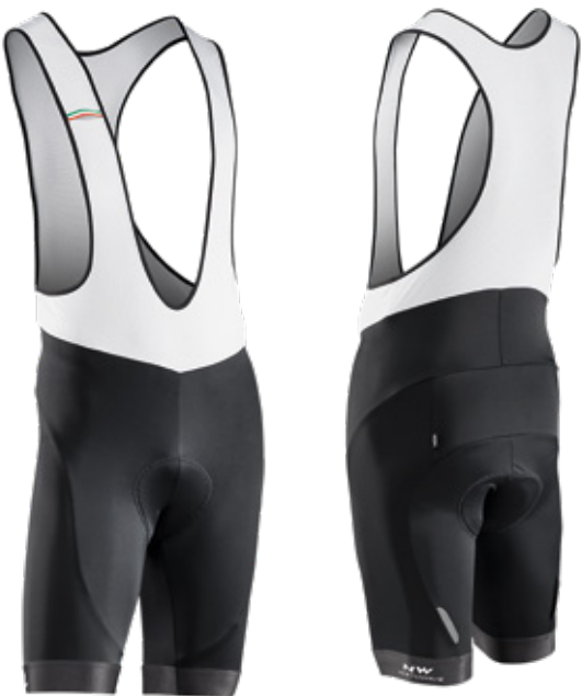
11 BLACK / WHITE