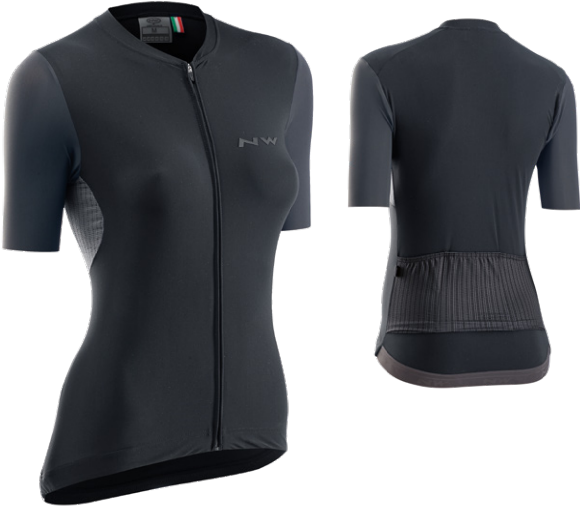
07 BLACK / GRAY