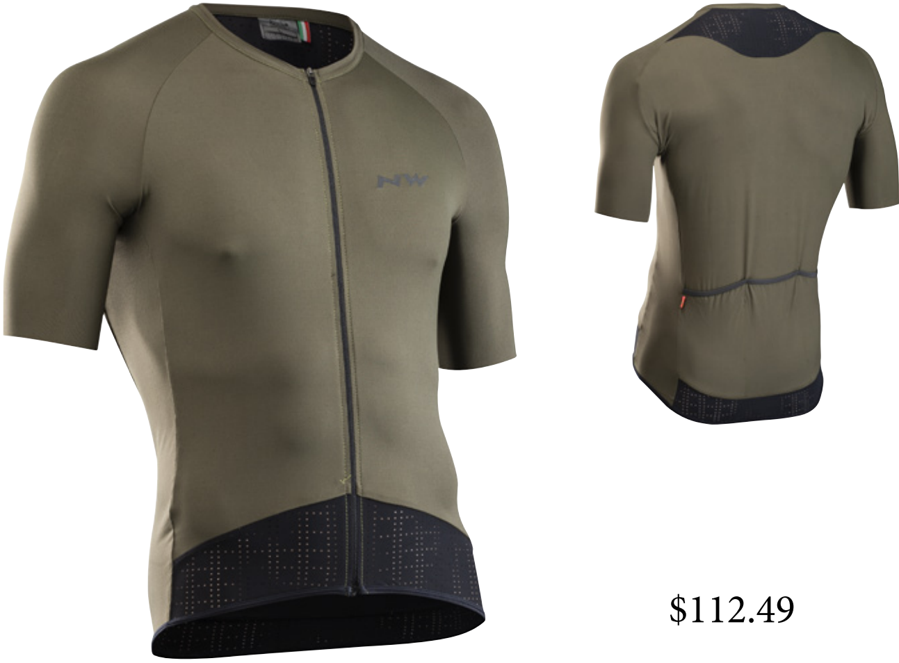
63 FOREST GREEN