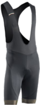
04 BLK / YELLOW FLUO