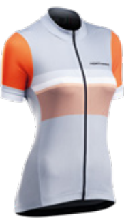
55 ICE / ORANGE