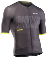
80 ANTHRACITE / YELLOW FLUO