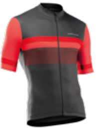
83 ANTHRA / RED