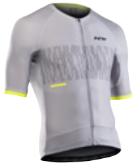
84 LIGHT GREY / YELLOW FLUO