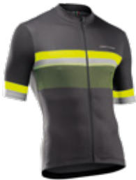
80 ANTHRA / YLLW FL