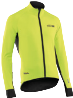
41 YELLOW FLUO / BLACK