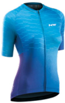
35 PURPLE BLUE