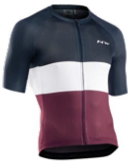
08 BLACK / WHITE / PLUM