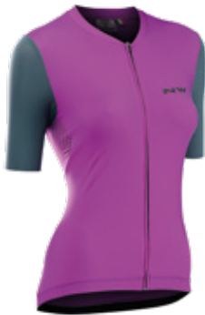
75 CYCLAM / ANTHRA