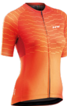
77 SIENA ORANGE