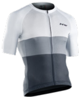
59 WHITE / ANTHRA