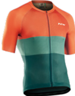
46 GREEN / SIENA ORA