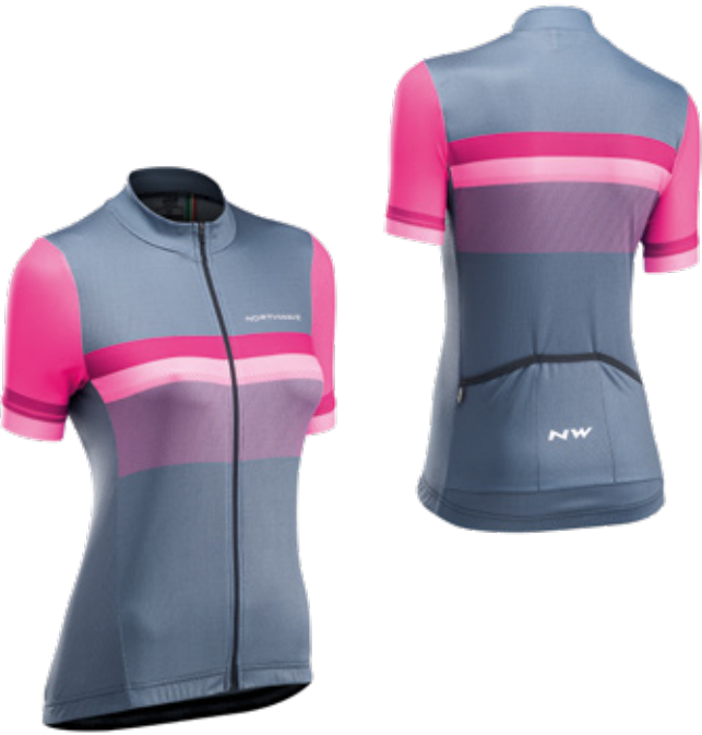
91 GRAY / MAGENTA