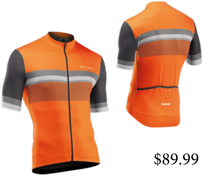
76 SIENA / ANTHRA