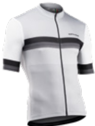
54 WHITE / GRAY