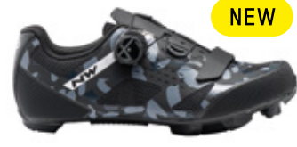
18 BLACK / HONEY