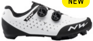
51 WHITE / BLACK