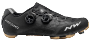
18 BLACK / HONEY

Different terrains means a shoe able to adapt to every condition. During the climbing of difficult ascents and on fast and technical descents, typical of a Marathon race, you need a shoe that is extremely performing and that is able to meet the needs of the athlete. The XCM2, now renewed thanks to the introduction of the double dial, gives the long-distance MTB enthusiasts very high performance, with a wide range of use, the true secret of the Ghost XCM2.