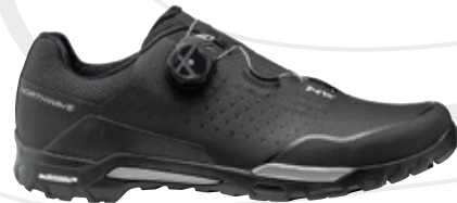
● X-TRAIL PLUS 80202024