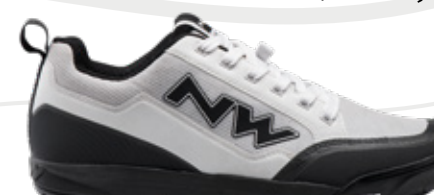
● CLAN 80193037