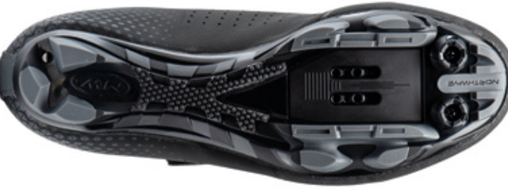
19 BLACK / ANTHRA

Triple-density Speedlight 3D sole with a stiffness index of 10.0