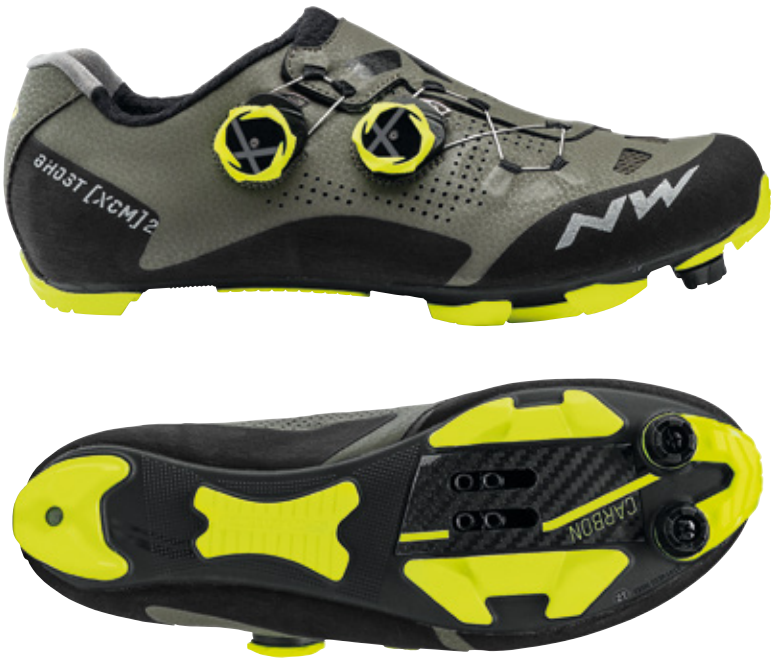
66 FOREST / YELLOW FLUO