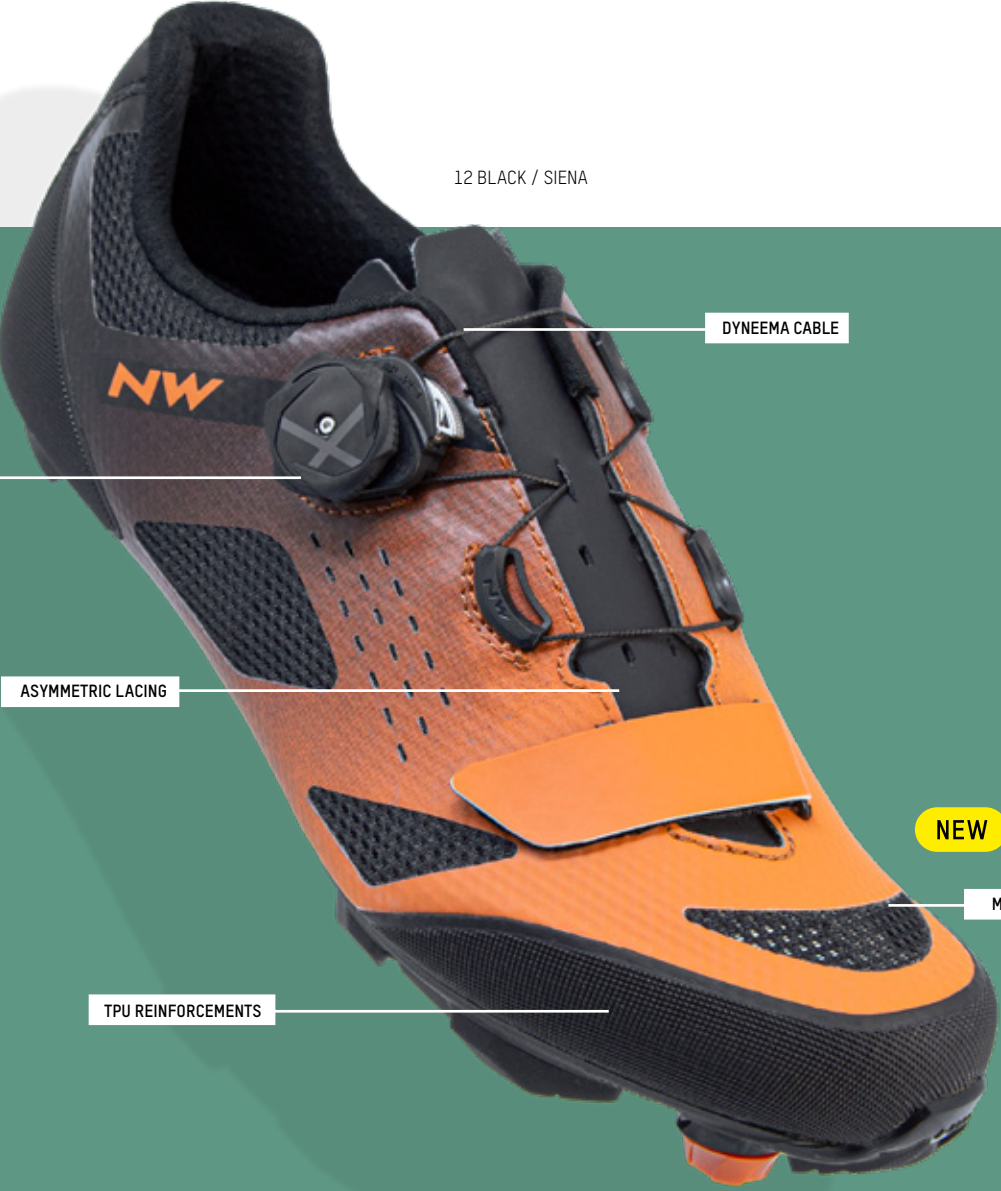
12 BLACK / SIENA