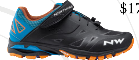
● SPIDER 2 80153009