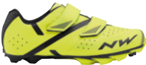
41 YELLOW FLUO / BLACK