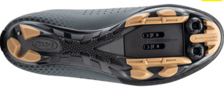
76 ANTHRA / HONEY