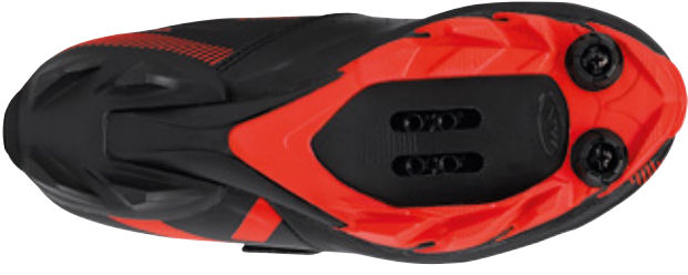
15 BLACK / RED