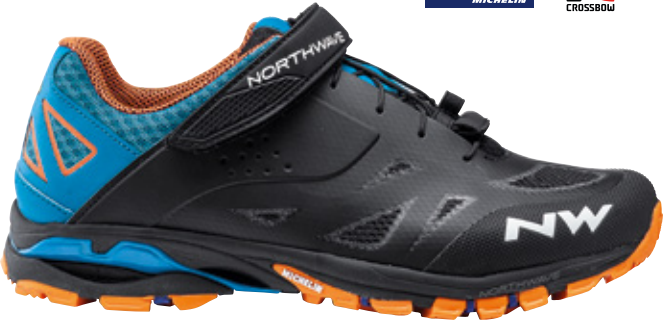
13 BLACK / BLUE / ORANGE