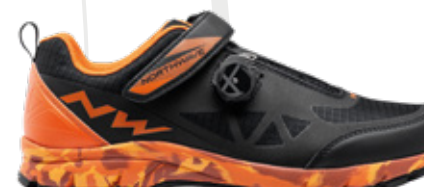
● CORSAIR 80193036