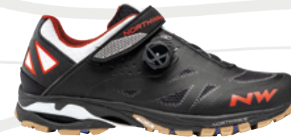
● SPIDER PLUS 2 80153008