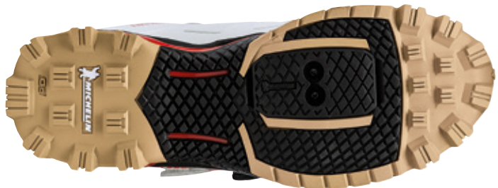
100 OFF WHITE / ORANGE