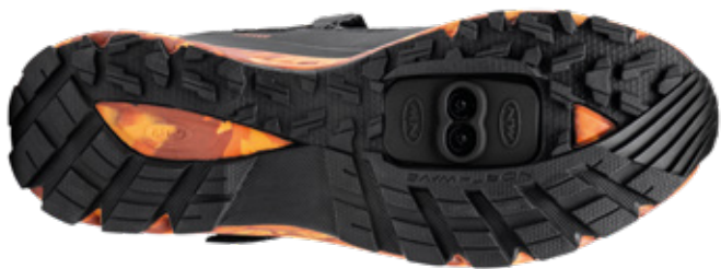
12 BLACK / SIENA