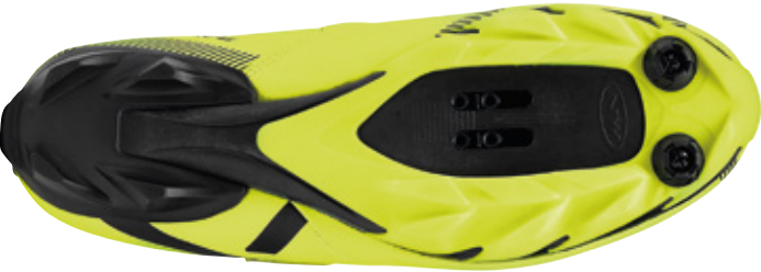
41 YELLOW FLUO / BLACK