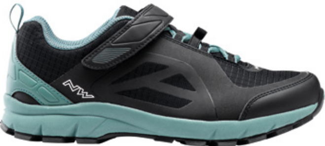
72 BLACK / COLORADO GREEN