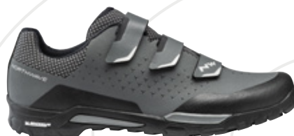
● X-TRAIL 80202023