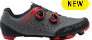
87 ANTHRA / RED