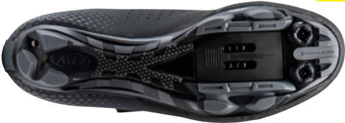
19 BLACK / ANTHRA