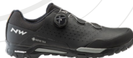
● X-TRAIL PLUS GTX 80204045