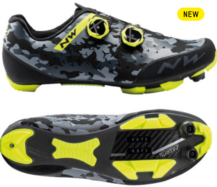
92 CAMO BLACK / YELLOW FLUO