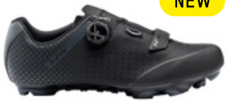
04 BLACK / YELLOW FLUO