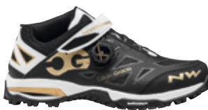
62 BLACK / OFF WHITE / GOLD

X-Fire sole with fast-clipping design and Michelin rubber for impressive grip on the pedal area and off the bike