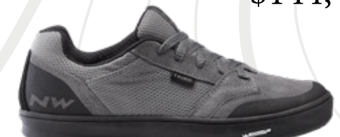
● TRIBE 80193038