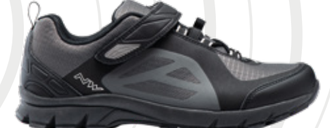
● ESCAPE EVO 80173010