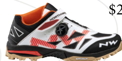
● ENDURO MID 80164041