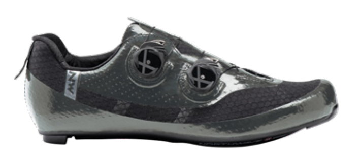
74 METAL ANTHRA