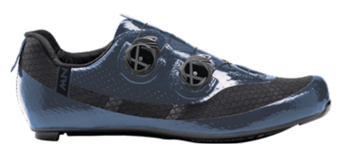
75 METAL BLUE