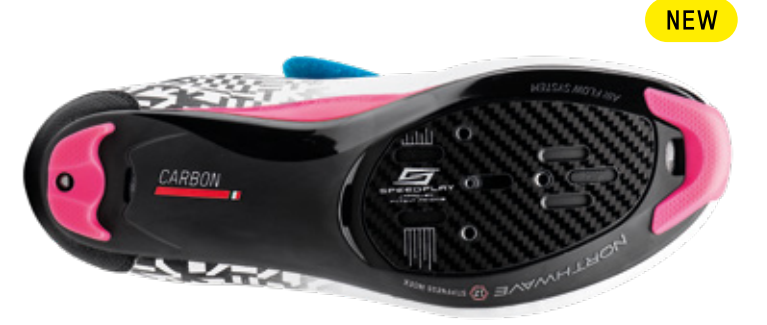
53 WHITE / BLACK / MULTICOLOR