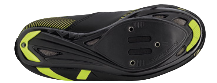
04 BLACK / YELLOW FLU0