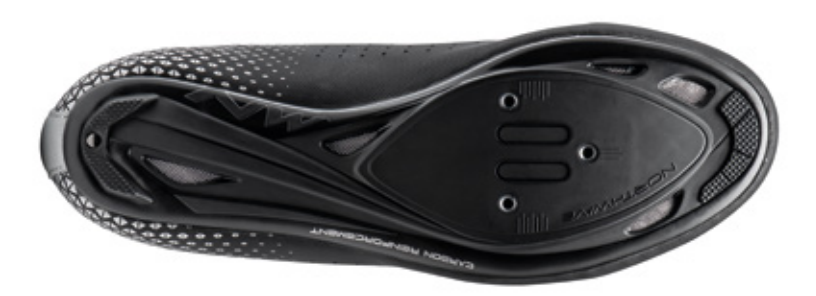
17 BLACK / SILVER