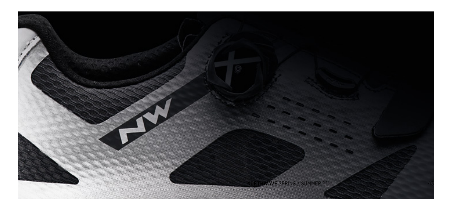
84 ANTHRA / BLACK