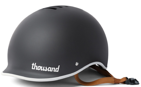
CARBON BLACK $89