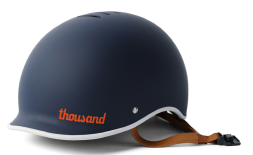
THOUSAND NAVY $89