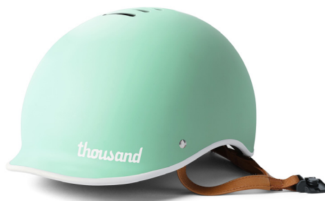
WILLOWBROOK MINT $89