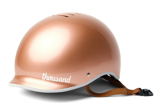
ROSE GOLD $89