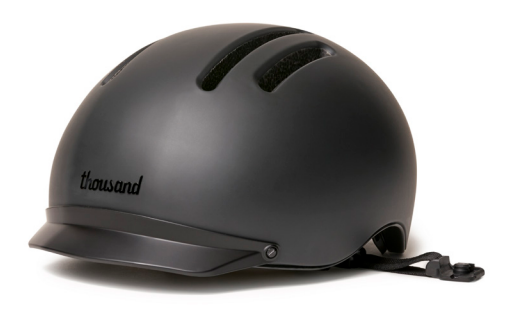
RACER BLACK $135