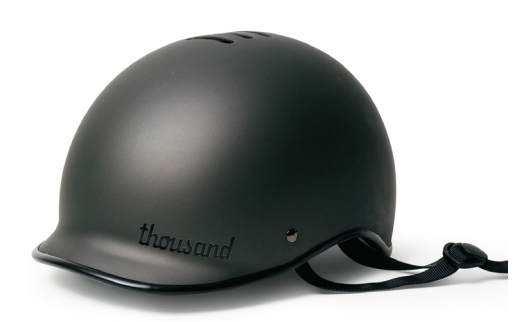
STEALTH BLACK $89