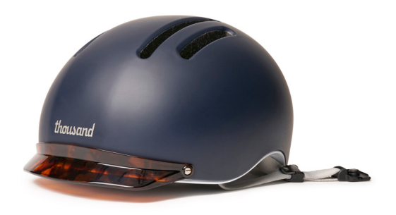
CLUB NAVY $135