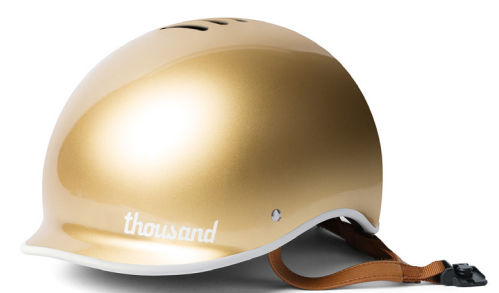
STAY GOLD $89