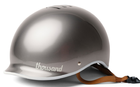
POLISHED TITANIUM $89