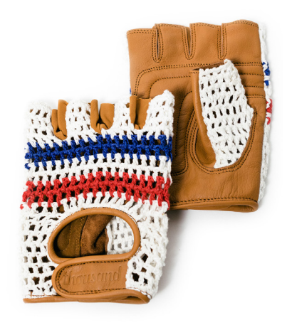
DE FRANC $27