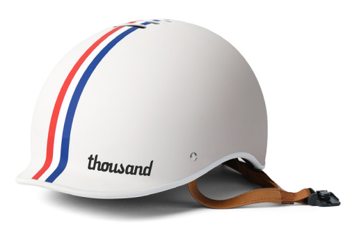
SPEEDWAY CREME $89