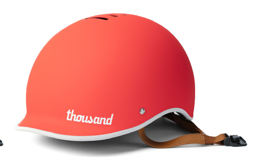
DAYBREAK RED $89