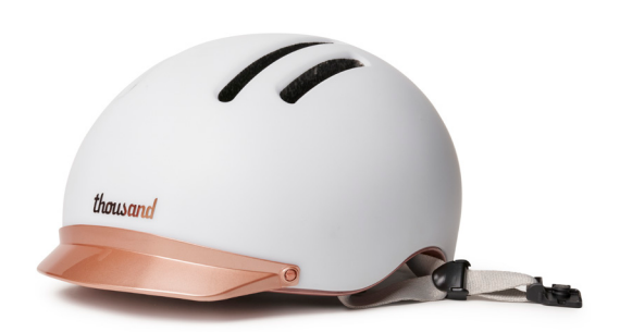
SUPERMOON WHITE $135