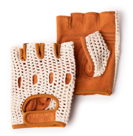
LITTLE 5 $23