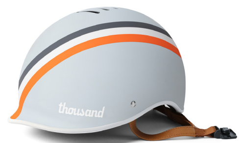
GT STRIPE $89