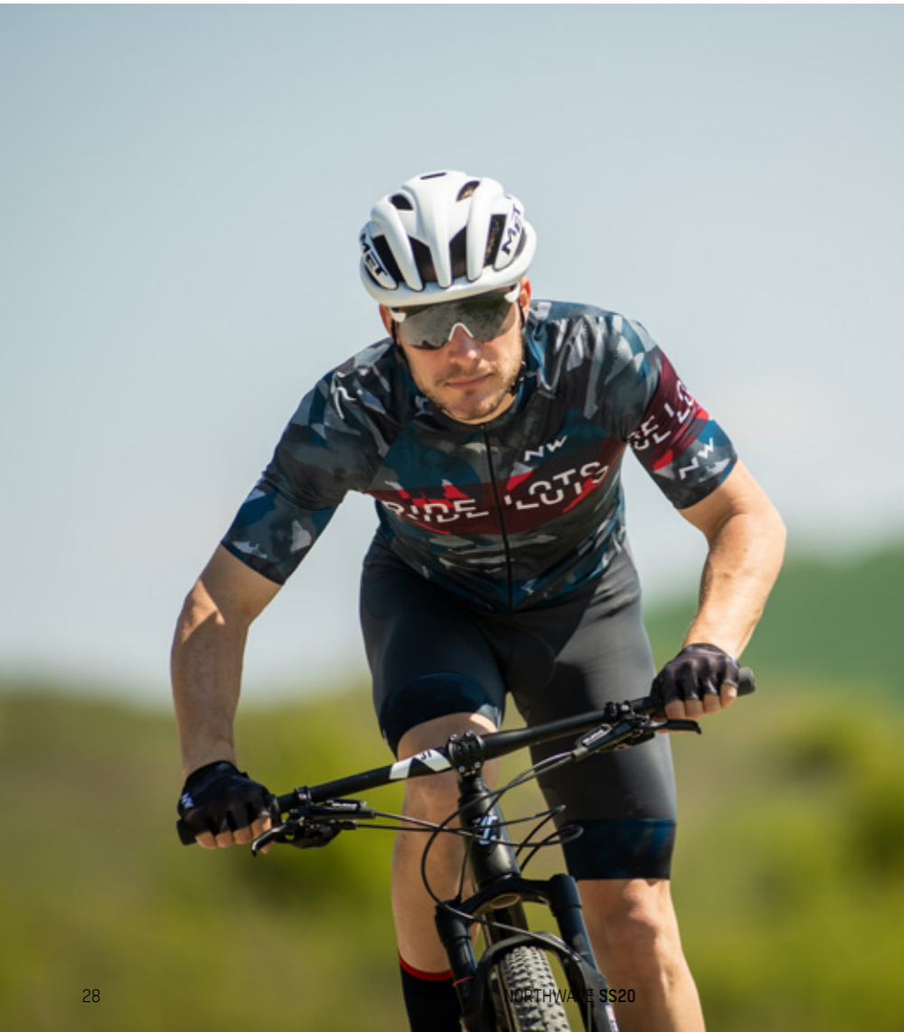
66 FOREST/YELLOW FLUO