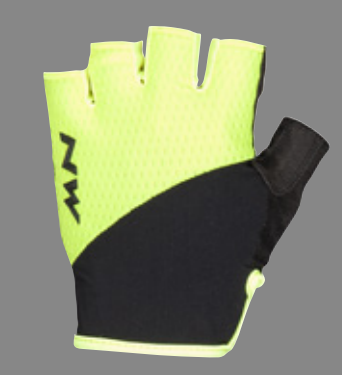
FAST GRIP SHORT FINGERS