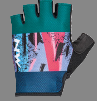
ACTIVE SHORT FINGERS