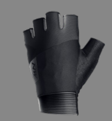
EXTREME SHORT FINGERS