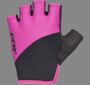
SWIFT WMN SHORT FINGERS