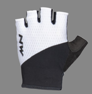
FAST SHORT FINGERS