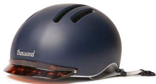
CLUB NAVY $135 USD | €155 EUR | £139 GBP