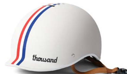
SPEEDWAY CREME $89 USD | €99 EUR £89 GBP