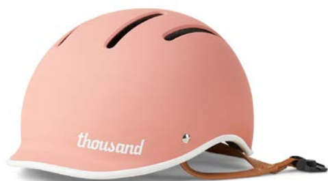
POWER PINK $60 USD | €65 EUR | £60 GBP