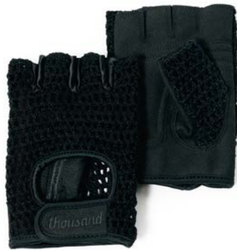
COURIER $23 USD | €23 EUR £23 GBP