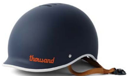
THOUSAND NAVY $89 USD | €99 EUR £89 GBP