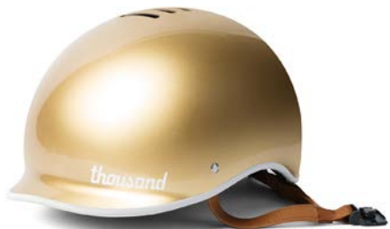
STAY GOLD $89 USD | €99 EUR £89 GBP