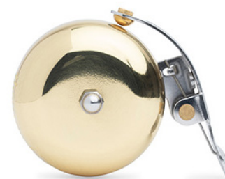
PENNANT BELL - BRASS $19 USD | €19 EUR | £19 GBP