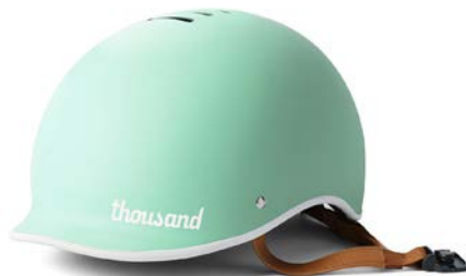
WILLOWBROOK MINT $89 USD | €99 EUR £89 GBP