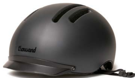
RACER BLACK $135 USD | €155 EUR | £139 GBP