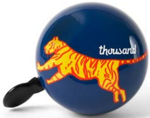
THOUSAND JR. BELL TIGER