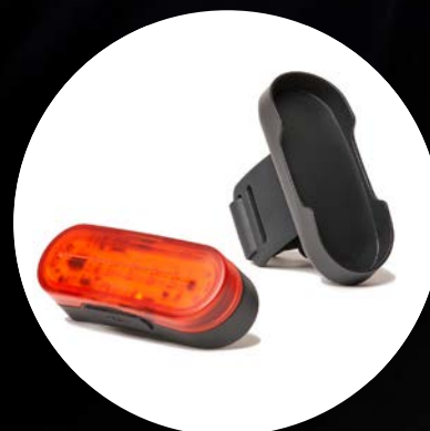
MULTI-USE ADAPTER INCLUDED