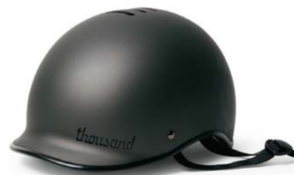
STEALTH BLACK $89 USD | €99 EUR £89 GBP