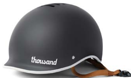
CARBON BLACK $89 USD | €99 EUR £89 GBP