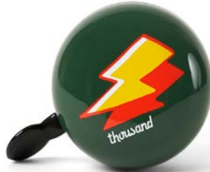
THOUSAND JR. BELL LIGHTNING BOLT