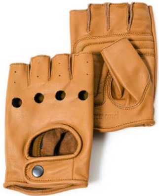
BULLITT $38 USD | €38 EUR £38 GBP