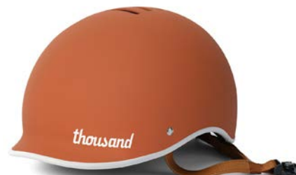
TERRA COTTA $89 USD | €99 EUR £89 GBP