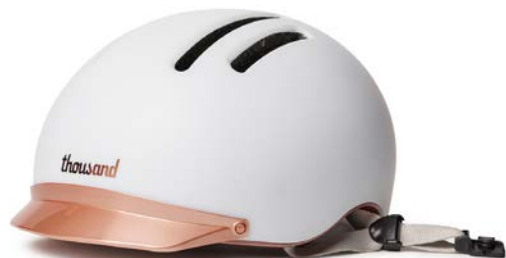
SUPERMOON WHITE $135 USD | €155 EUR | £139 GBP