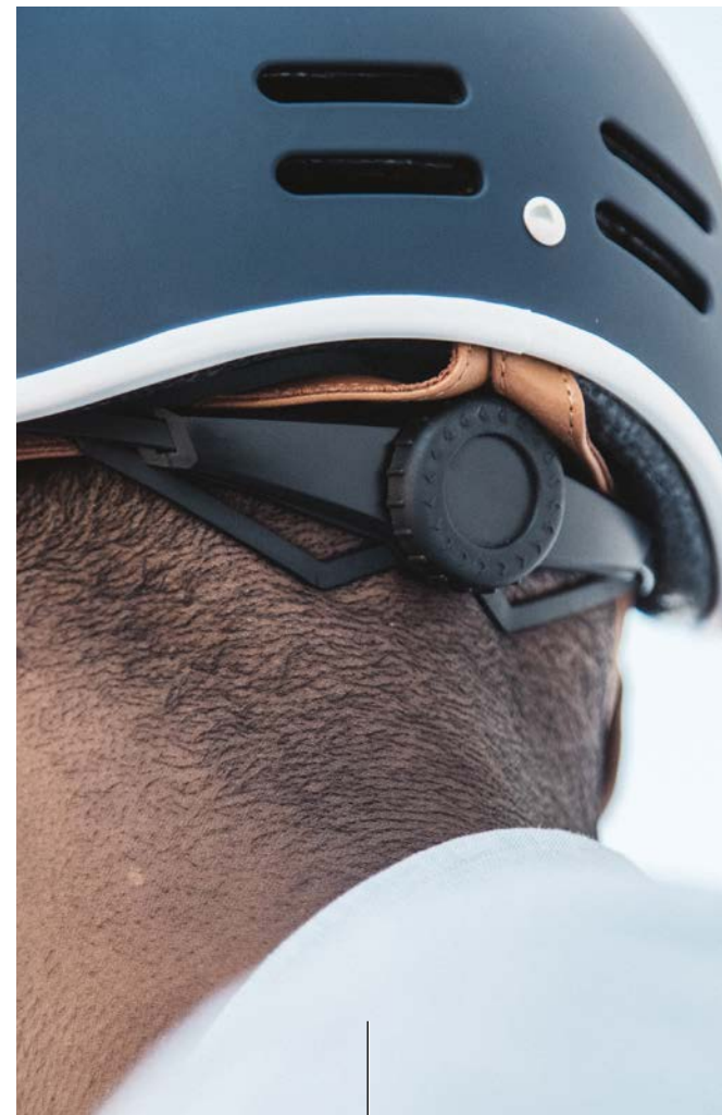
DIAL FIT SYSTEM