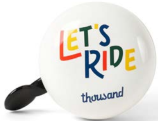
THOUSAND JR. BELL LET'S RIDE