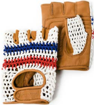
DE FRANC $27 USD | €27 EUR £27 GBP