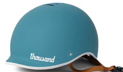
COASTAL BLUE $89 USD | €99 EUR £89 GBP