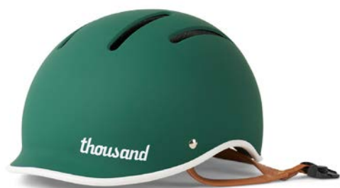
GOING GREEN $60 USD | €65 EUR | £60 GBP