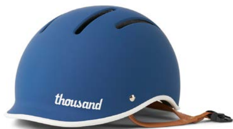
BLAZING BLUE $60 USD | €65 EUR | £60 GBP