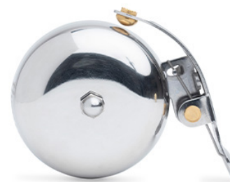
PENNANT BELL - STAINLESS STEEL $19 USD | €19 EUR | £19 GBP