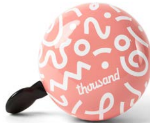
THOUSAND JR. BELL TIGER