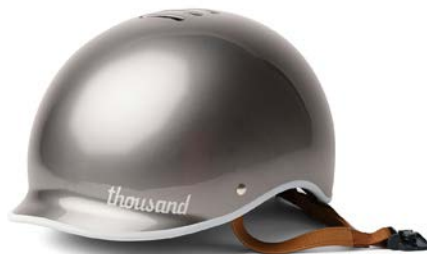
POLISHED TITANIUM $89 USD | €99 EUR £89 GBP