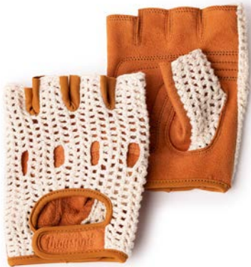
LITTLE 5 $23 USD | €23 EUR £23 GBP