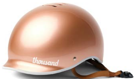
ROSE GOLD $89 USD | €99 EUR £89 GBP