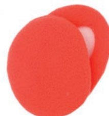
HiViz Orange S 563012 M 563013 L 563014