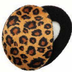
Leopard S 563021 M 563022 L 563023