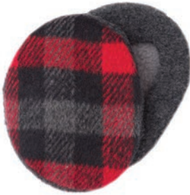
Buffalo Black & Red Plaid S 564300 M 564301 L 564302