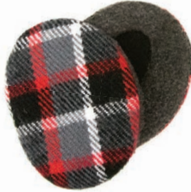
Gray/Red Plaid M 564322 L 564323