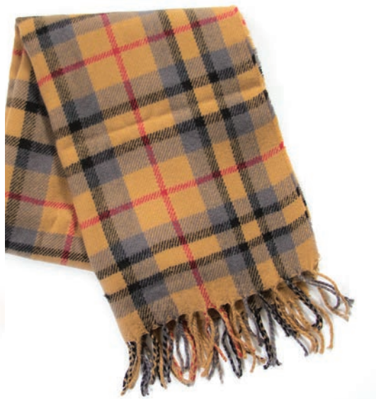
Tan Plaid 572000