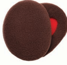
Brown S 563006 M 563007 L 563008