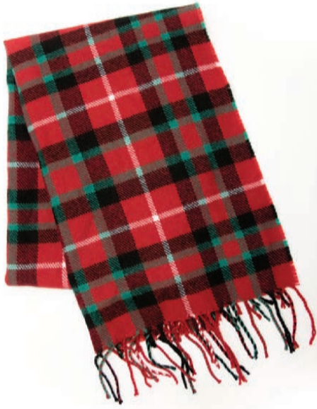
Red/Green Plaid 572003

This classic plaid print yarn dyed scarf with fringe ends is perfect to warm up any style or look. It measures 69" L x 16 1/2" W so you can wrap it many different ways. The scarf is made of soft, washable acrylic.