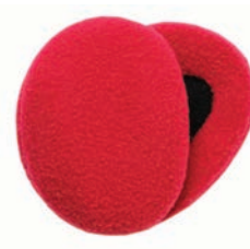
Red S 563003 M 563004 L 563005