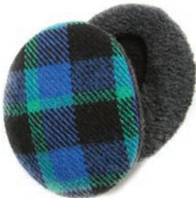
Blue/Green Plaid M 564324 L 564325