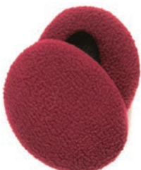
Burgundy S 563055 M 563048 L 563049