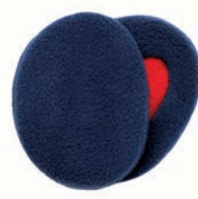
Navy S 563024 M 563025 L 563026