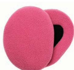
Pink S 563015 M 563016 L 563017