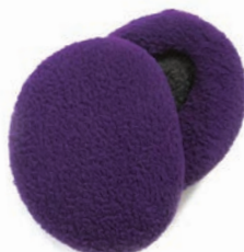
Eggplant S 563056 M 563050 L 563051