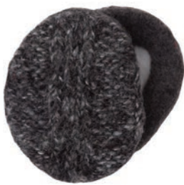
Charcoal S 564218 L 564220

Faux Mohair Knits lined with fleece have a beautiful handmade classic winter look.