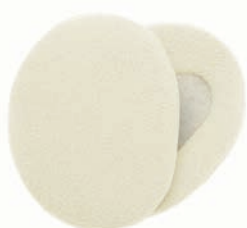
Cream S 563030 M 563031 L 563032