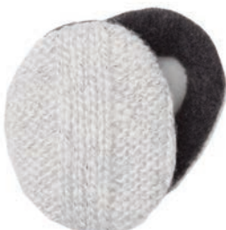
Cream S 564230 M 564231 L 564232