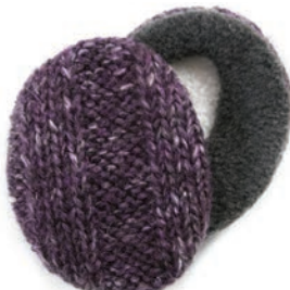
Purple S 564227 M 564228