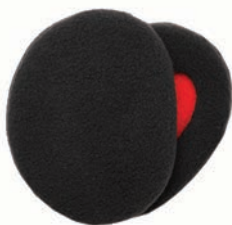
Black S 563000 M 563001 L 563002

Soft double-lined fleece in basic colors. Great for men, women and children!