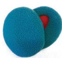
Teal S 563057 M 563058 L 563059