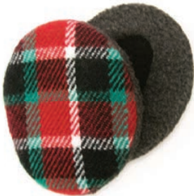
Red/Green Plaid M 564326 L 564327