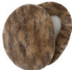
Green Camouflage S 563045 M 563046 L 563047