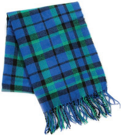
Blue/Green Plaid 572002