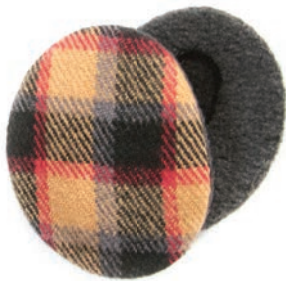
Tan Plaid M 564320 L 564321

Plaid Prints lined with fleece are right on fashion trend and are perfect for any time, day or night.