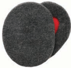
Charcoal S 563018 M 563019 L 563020