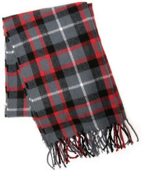
Gray/Red Plaid 572001