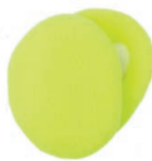
HiViz Yellow S 563039 M 563040 L 563041