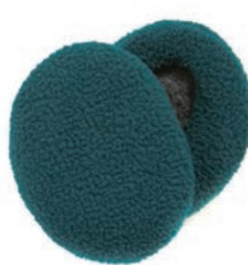
Hunter S 563054 M 563052 L 563053