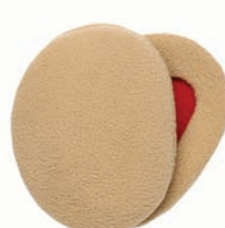
Camel S 563009 M 563010 L 563011