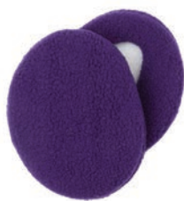
Purple S 563027 M 563028 L 563029