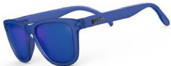
Falkor's Fever Dream