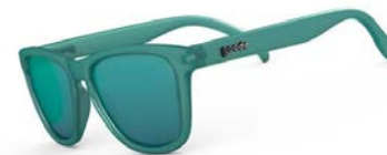
Nessy's Midnight Orgy - 4