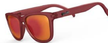
Phoenix at a Bloody Mary Bar - 3