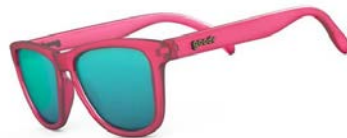
Flamingos on a Booze Cruise - 4