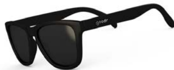
A Ginger's Soul - 6