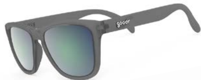
Silverback Squat Mobility