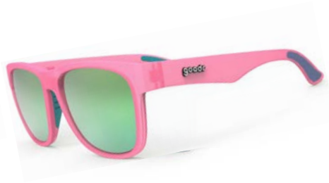
Do You Even Pistol, Flamingo - 2