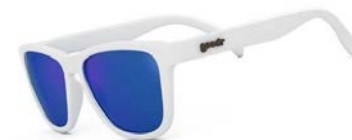
Iced by Yetis - 4