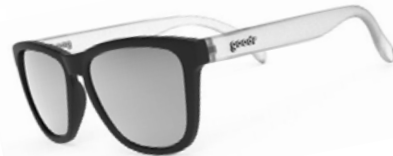
The Empire Did Nothing Wrong