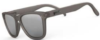
Going to Valhalla...Witness!