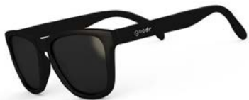
A Ginger's Soul