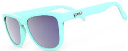
Electric Dinotopia Carnival