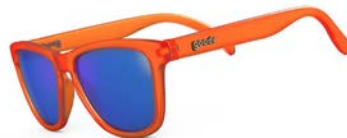
Donkey Goggles - 3