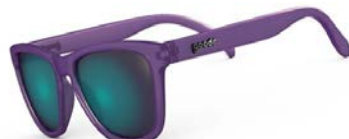
Gardening with a Kraken