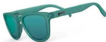
Nessy's Midnight Orgy