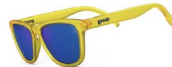
Swedish Meatball Hangover - 3