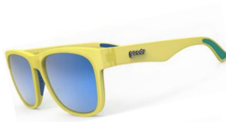
METCONing For Meatballs - 2