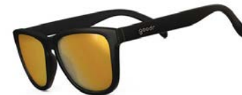
Whiskey Shots with Satan - 6