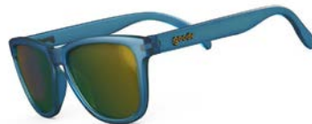
Sunbathing with Wizards - 4