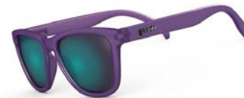
Gardening With a Kraken - 4