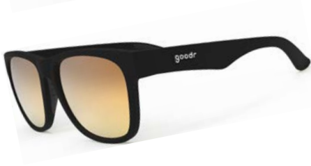
Beelzebub's Bourbon Burpees - 2