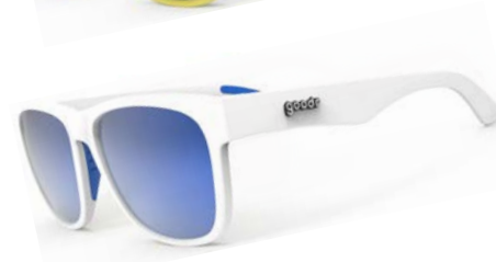
Iced by Sas-squat - 2