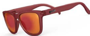
Phoenix at a Bloody Mary Bar