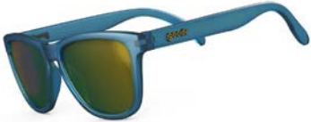
Sunbathing with Wizards - 4