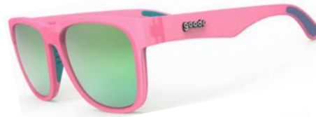
Do You Even Pistol, Flamingo? SKU: BFG-PK-TL4-RF UPC: 680168540701 LINK TO ART