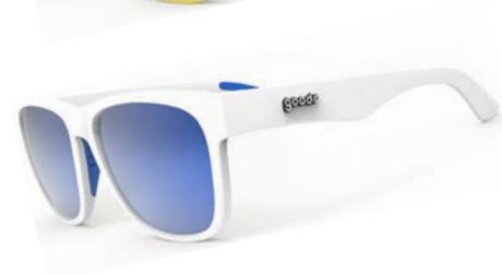
Iced by Sas-squat - 2