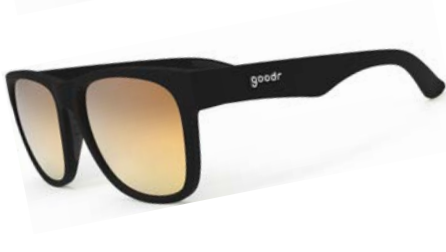
Beelzebub's Bourbon Burpees - 2