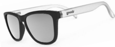
The Empire Did Nothing Wrong