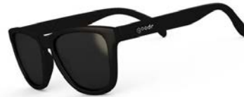
A Ginger's Soul - 6