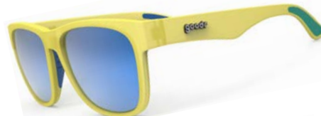
METCONing for Meatballs SKU: BFG-YL-BL2-RF UPC: 680168540732 LINK TO ART