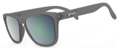
Silverback Squat Mobility