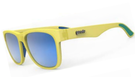
METCONing For Meatballs - 4