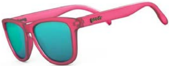
Flamingos on a Booze Cruise - 4