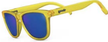
Swedish Meatball Hangover - 3