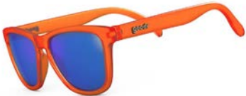
Donkey Goggles - 3