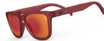
Phoenix at a Bloody Mary Bar - 3