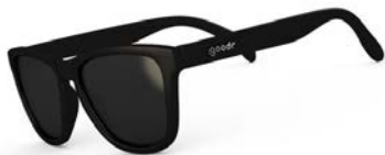
A Ginger's Soul SKU: OG-BK-BK1 UPC: 705911703636 LINK TO ART