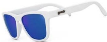
Iced by Yetis - 4