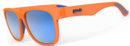
That Orange Crush Rush SKU: BFG-OR-BL2-RF UPC: 680168540749 LINK TO ART