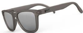
Going to Valhalla...Witness! SKU: OG-GY-CH1 UPC: 705911703605 LINK TO ART