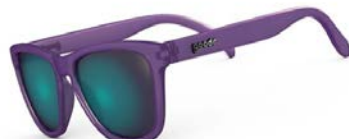
Gardening with a Kraken SKU: OG-PR-PR1 UPC: 705911703612 LINK TO ART