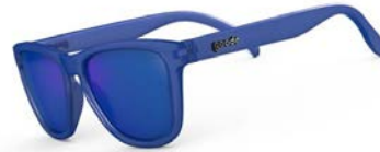
Falkor's Fever Dream - 3