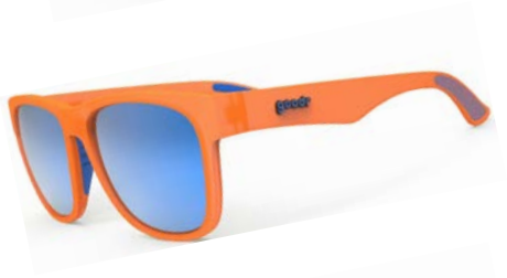
That Orange Crush Rish - 2