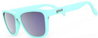
Electric Dinotopia Carnival