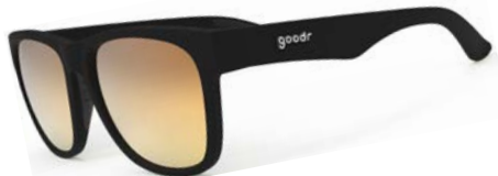
Beelzebub's Bourbon Burpees SKU: BFG-BK-AM2-RF UPC: 680168540695 LINK TO ART