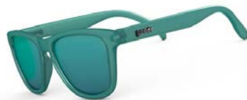
Nessy's Midnight Orgy SKU: OG-TL-TL1 UPC: 705911703629 LINK TO ART