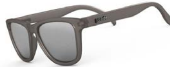
Going to Valhalla... Witness! - 4