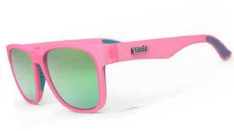
Do You Even Pistol, Flamingo - 2