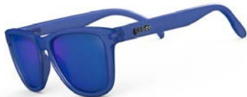
Falkor's Fever Dream SKU: OG-BL-BL1 UPC: 705911703599 LINK TO ART