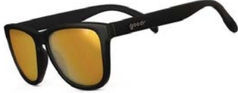
Whiskey Shots with Satan - 6