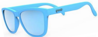
Pool Party Pregame