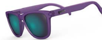
Gardening With a Kraken - 4