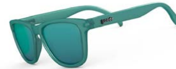
Nessy's Midnight Orgy - 4