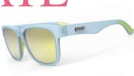
Ice Bathing With Wizards - 2