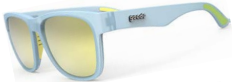
Ice Bathing With Wizards SKU: BFG-BL-GD5-RF UPC: 680168540718 LINK TO ART