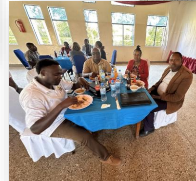
Celebration Meal at Mshikamano VTC