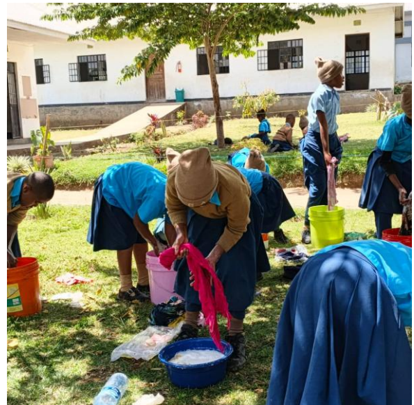
Standard Two Pupils Learn by Doing