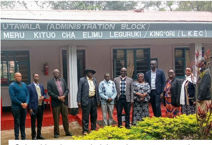
School leaders and visitors inspect renovations.

LKEC includes both a vocational training center and a secondary school.