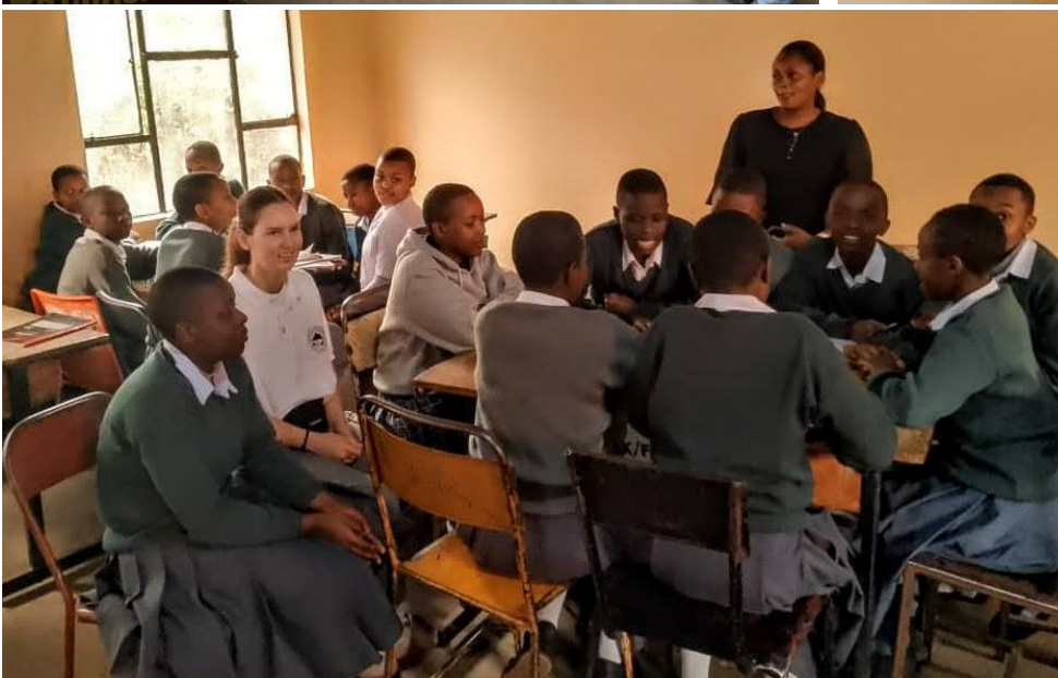
Students actively involved in group discussions in the secondary school.