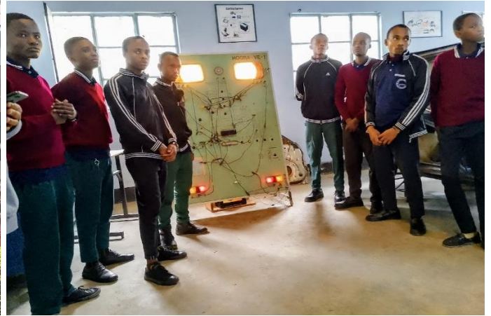
They visit practical classes above and below.