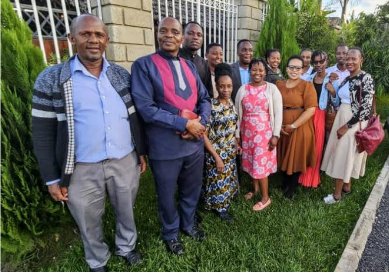
This is a staff motivation event where all staff were rewarded for their good work and student performance.