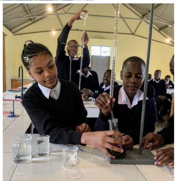
Students doing practical work in the chemistry lab.