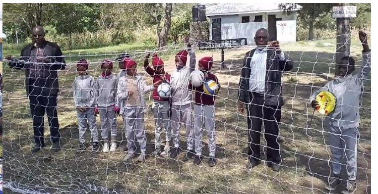
Students assemble, for announcements etc.