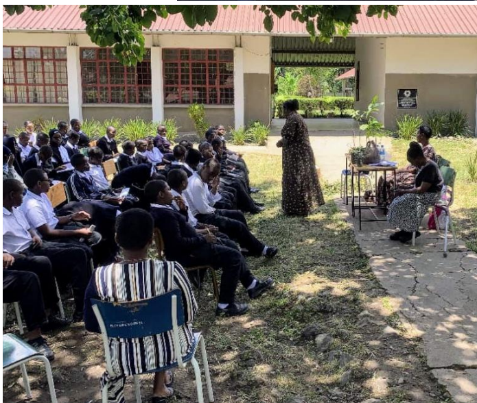
Vegetable workshop for students given by an outside organization.