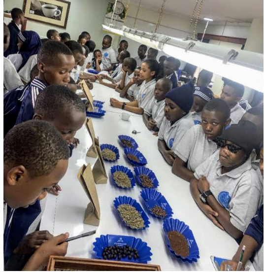
School field trip to coffee plantations in Moshi.