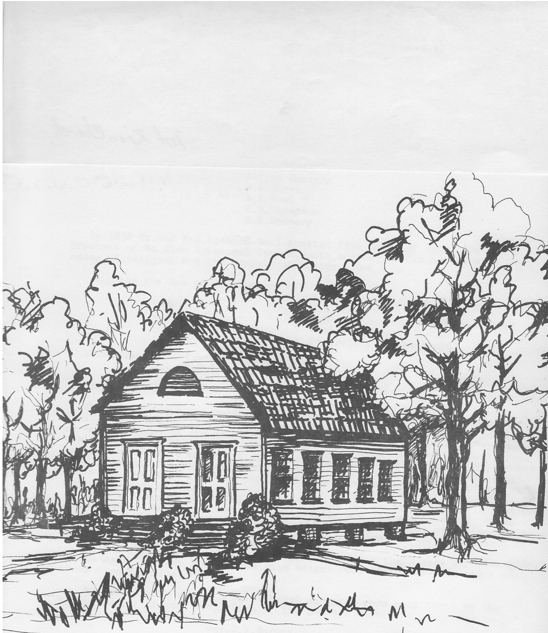
Mt. Zion Church Drawn by Wyolene Windham