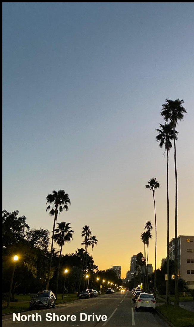
North Shore Drive