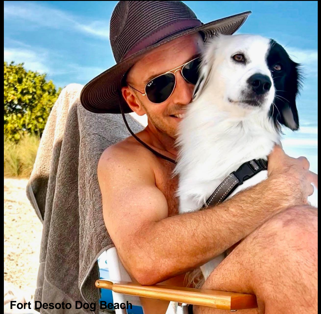
Fort Desoto Dog Beach