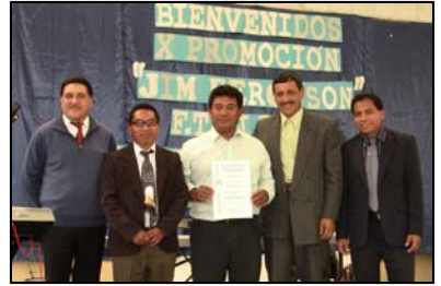
FTEI 10 th Graduation Ceremony