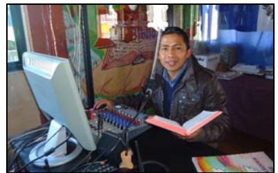
LAMP shares the Bible in Mam

The New Testament was translated to Mam 16 years ago. Although Mam is widely spoken, literacy rates are low. LAMP teaches people to read the Bible in their heart language.