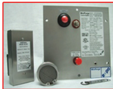
Z-Purge System Class 1, Div 2 Areas