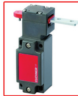
Low voltage Safety Switch