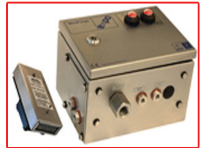
X-Purge System Class 1, Div 1 Areas

Design > Fabrication > Installation > Integration > Work Safely!