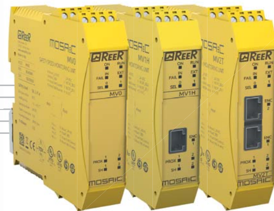
MV0 MV1 MV2