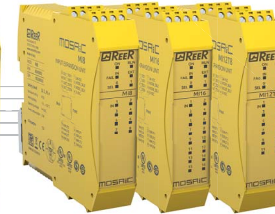
MI8 MI16 MI12T8