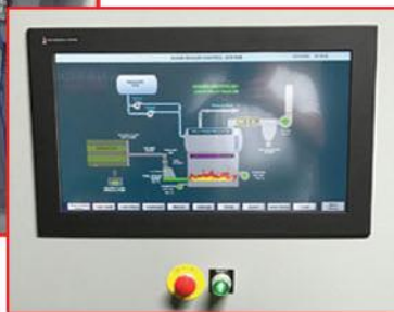
Custom HMI Panel