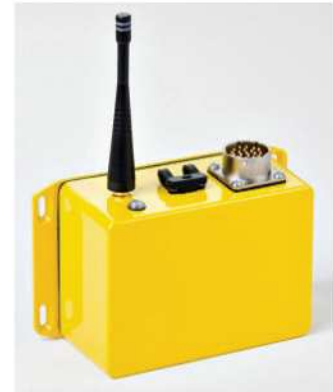
Wireless Safety Device

Can easily be wired into existing e-stop systems