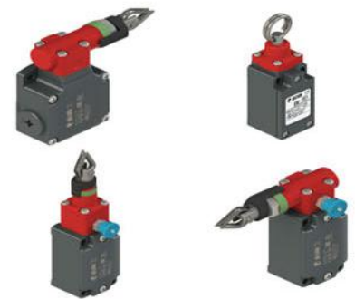
Emergency Rope Pulls