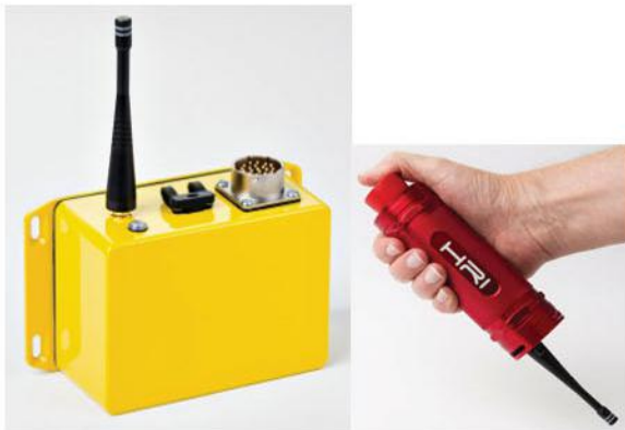
Wireless E-Stop System