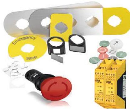
Safety Relays, Legend Plates Buttons for Enclosures