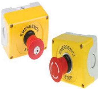
Emergency Stop Switches

Manually-controlled wired and wireless e-stop devices in case of an emergency