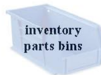
inventory parts bins