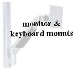
monitor & keyboard mounts

Good working posture • Boost productivity • Reduced repetitive movements Modular design • Quickly adjustable • Easily expandable