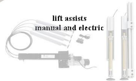
lift assists manual and electric

OSHA General Duty Clause, Section 5 requires that each employer furnish to each of its employees a workplace that is free from recognized hazards that are causing or likely to cause death or serious physical harm.