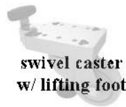
swivel caster w/ lifting foot