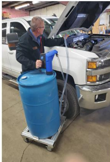
24" x 24" Platform

Ergonomic aid to moving 55-gallon drums across your facility