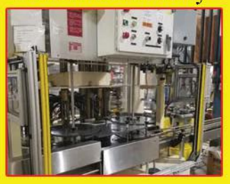
Machine Tool Safety Guards