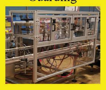
Electronic Machine Safety