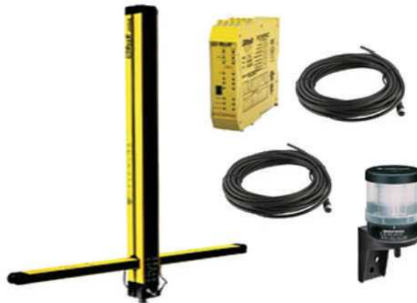
Monitoring Beacon for muting indication