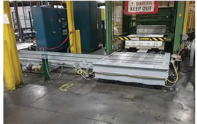
Safety Light Curtain muted by strategic sensors placed to monitor a pallet