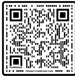
Tryout Google Form