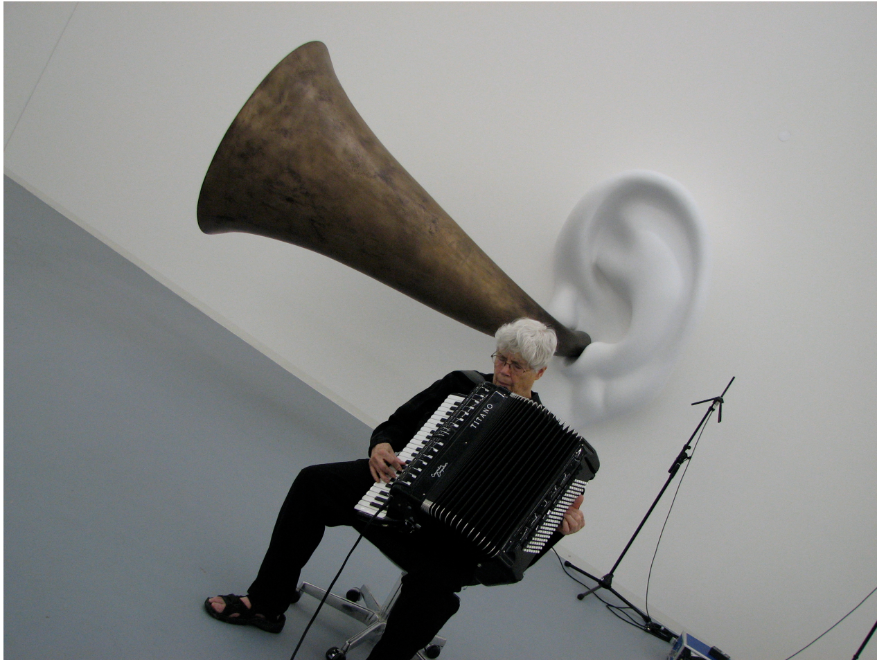
Oliveros, P. (2005). Deep Listening: A Composer's Sound Practice . iUniverse.