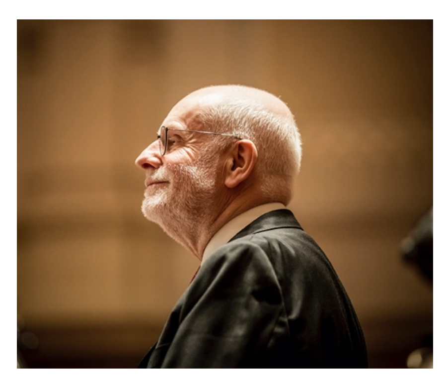
Thursday 1<sup>st</sup> August – Sunday 4<sup>th</sup> August 2024 Périgord Vert, France