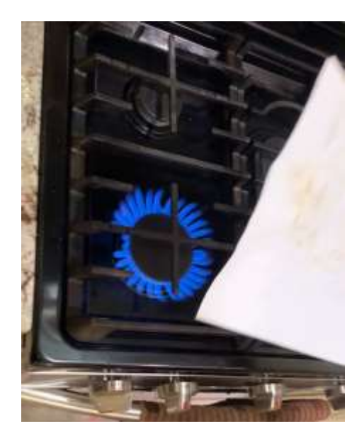
Have an adult hold your secret message over a stove, candle or bright lightbulb to reveal the message