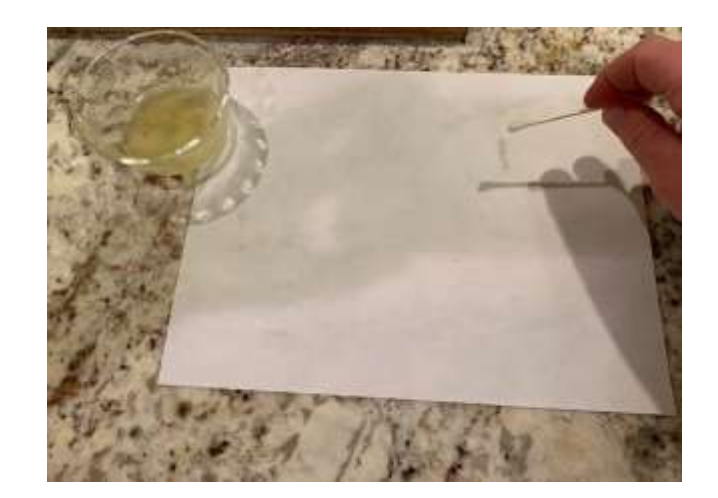
Use a plain sheet of paper and a cotton swab to write your secret message.