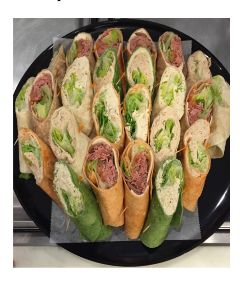
Finger Sandwiches $59.00/Dozen