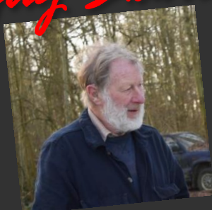
Clerk of the Course

Welcome to the 1st round of the 2026 Normandale series.