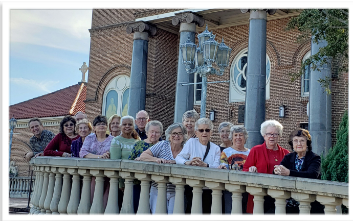
Pictured above is the November 2019 Club 55+ Bus trip group in front of the St. Anthony Cathedral Basilica in Beaumont where they enjoyed a docent-led tour.