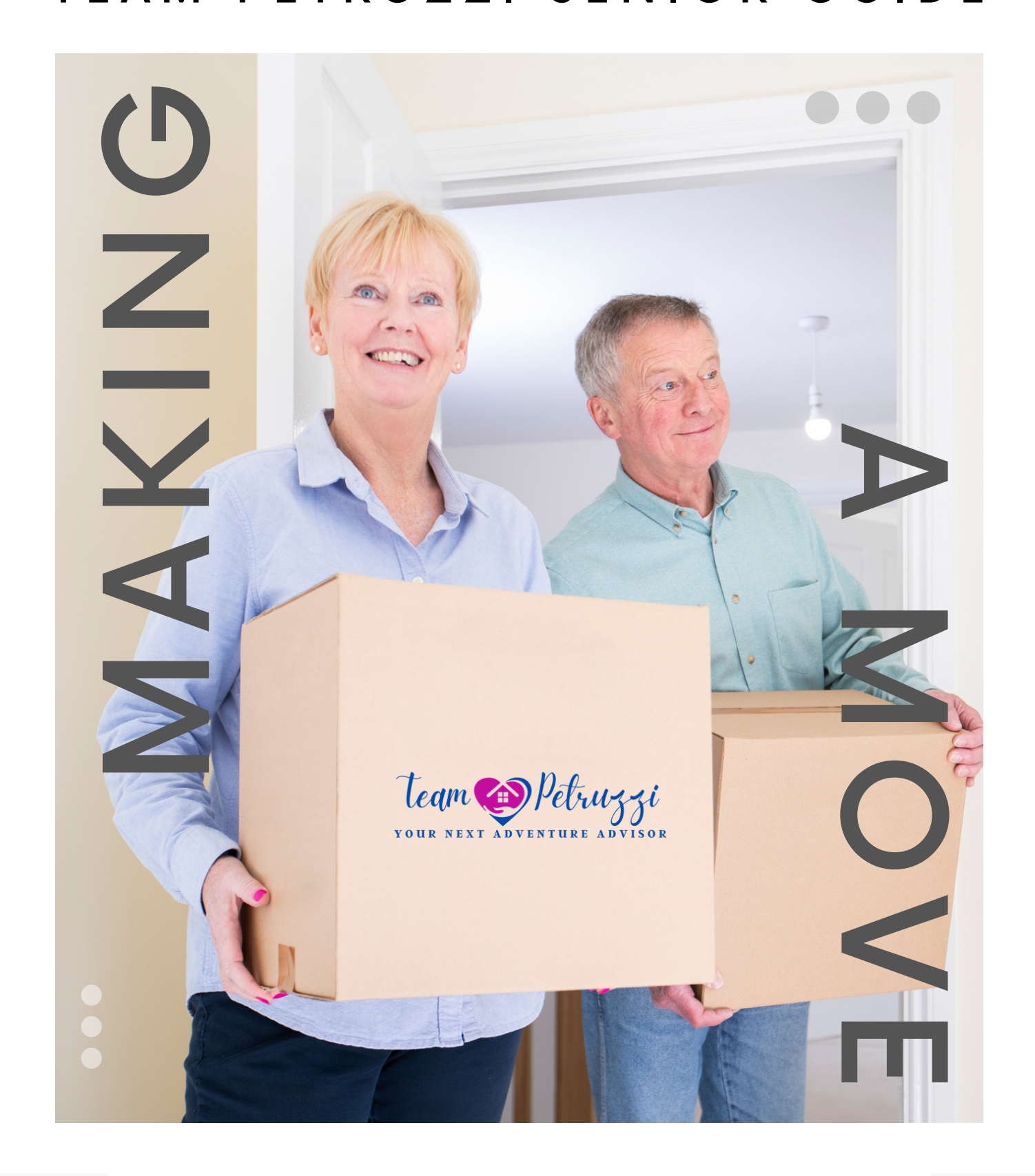
5 things to consider before making your senior move