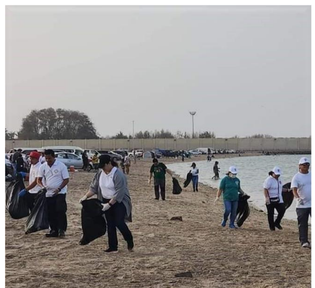
Participants during the cleanup drive